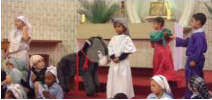
Kindergarten- Palm Sunday