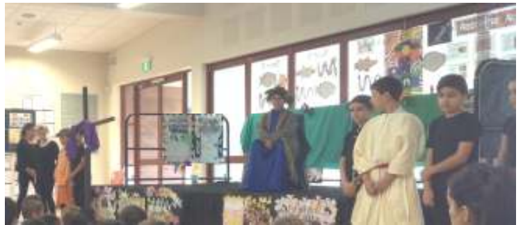
Year 5 Jesus is Trailed and Sentenced to