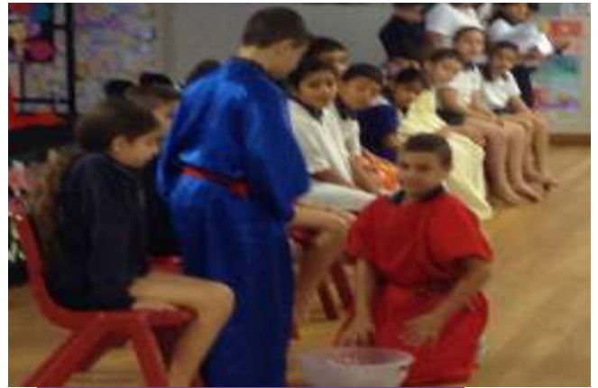
Year 4 – Holy Thursday