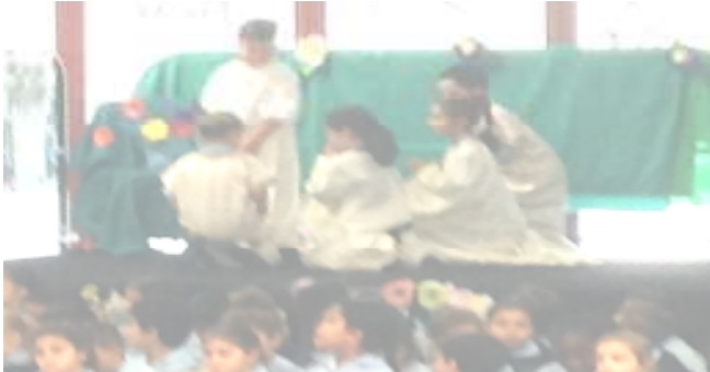
Year One—Garden of Gethsemane