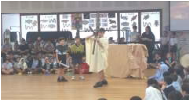
Year 6 – The Stations of the Cross